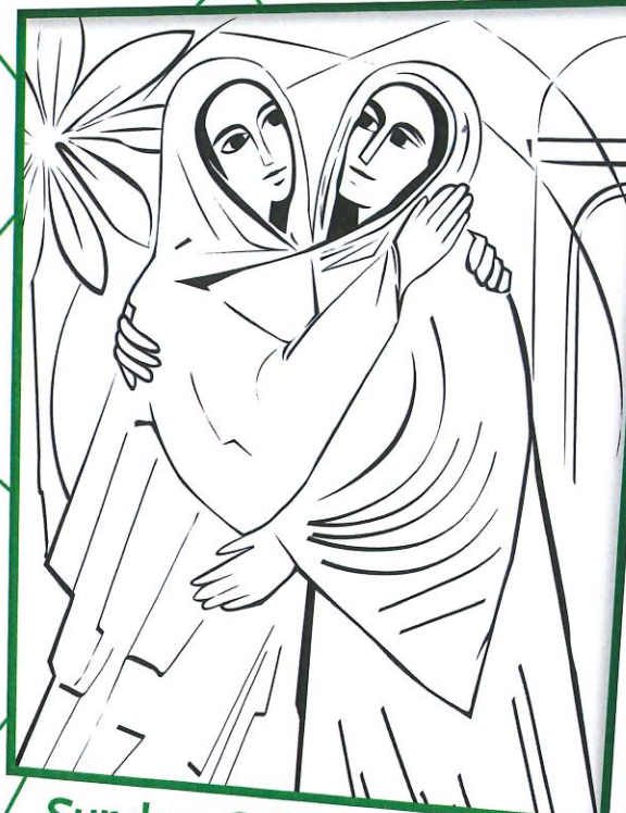
Sunday 22 nd December