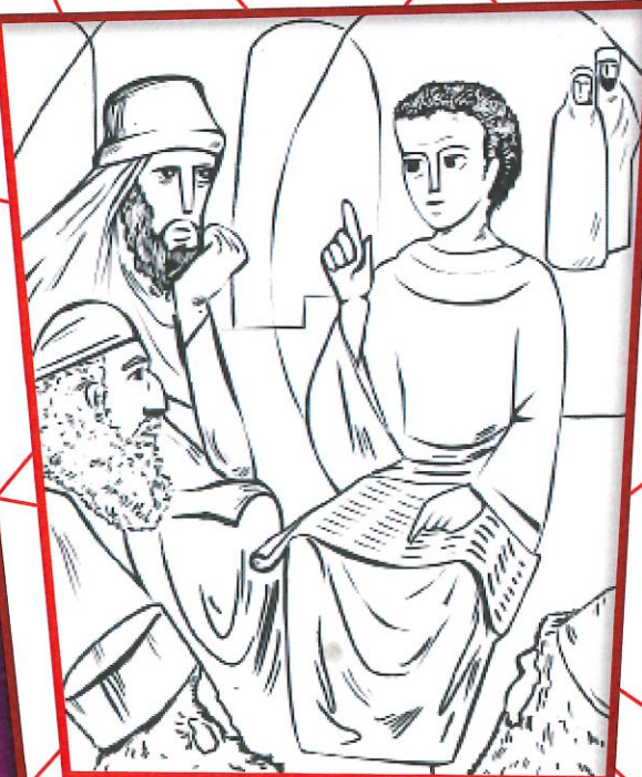
Sunday 29 th December