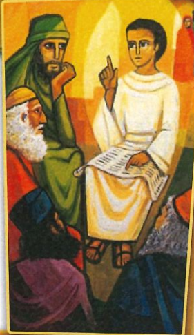
From the Gospel of Sunday 29 th December 2024 Luke 2:41-52 (the Feast of the Holy Family, Year C)

Every year Joseph and Mary went to Jerusalem to celebrate the feast of the Passover. When Jesus was twelve he went with them. After the feast, on the way home, Mary and Joseph realised that Jesus was missing from the group. So they went back to Jerusalem to look for him. After three days, they found Jesus in the Temple, listening to the teachers and asking them questions. The teachers were amazed at his intelligence. His parents were overcome when they found him and told him how worried they had been. "Why were you looking for me?" asked Jesus. "Did you not know that I would be in my Father's house?" Then Jesus went back home to Nazareth and lived in obedience to his parents. He grew in wisdom and grew in favour with God and the people.