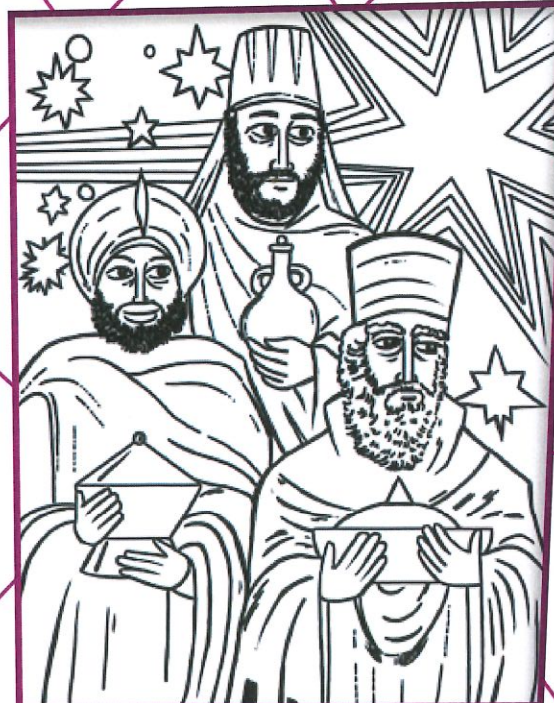
Sunday 5 th January