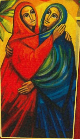
From the Gospel of Sunday 22 nd December 2024 - Luke 1:39-44 (the 4 th Sunday of Advent, Year C)

Mary had been told by an angel that she was to give birth to a son named Jesus. When she heard that her cousin, Elizabeth, was also going to have a baby, she went as quickly as she could to visit Elizabeth. Mary went into Zechariah's house and greeted Elizabeth. Now as soon as Elizabeth heard Mary's greeting, the child leapt in her womb and Elizabeth was filled with the Holy Spirit. Elizabeth gave a loud cry and said to Mary, "Of all women you are the most blessed, and blessed is the fruit of your womb. Why should I be honoured with a visit from the mother of my Lord? For as soon as your greeting reached my ears, the child in my womb leapt for joy. Yes, blessed are you for believing the promise made to you by the Lord."